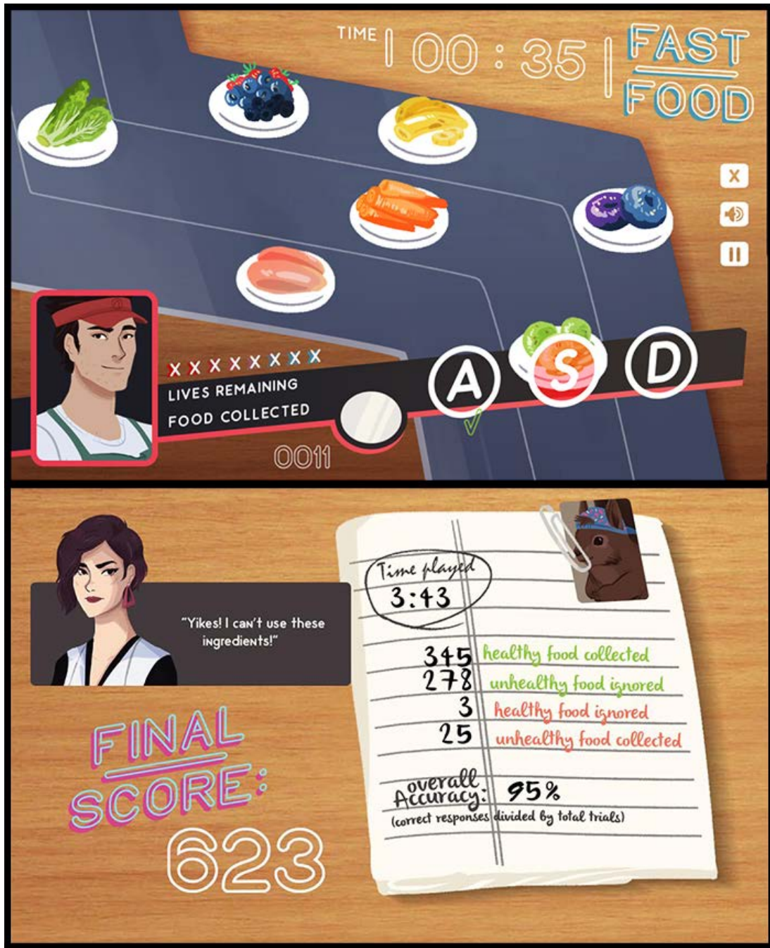
Figure 1: Two screenshots of Fast Food (Cachia & Portelli, 2015), one of the five transformative videogames developed to be used in experimental research at the BSI.