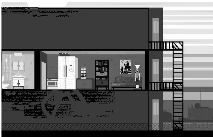
Fig. 10 – Cart Life 13

environment is presented in black and white, and there is really nothing else to do in it other than walk. Once players reach the bench, the woman sits down and a song starts playing. During the song, the woman gives her last breath, and the game ends. Here, once again, a player seeking for the stimulation of the fear structure will likely be bored. But the game uses the contrast to fast-paced, action-packed games to shift the attention from what we are doing as players to other aspects of the fiction. The game underscores death and can thus stimulate reflection on that topic itself, help players put their own lives into perspective, or think about their relation to the elderly members of their families. The Graveyard risks boring players to induce a contemplative state. And even if the player does get bored and starts thinking about time, the point of the game is not lost. On the contrary, by inducing boredom and making players think about time, the game brings them closer to the theme at the center of the experience: the end of someone's life.