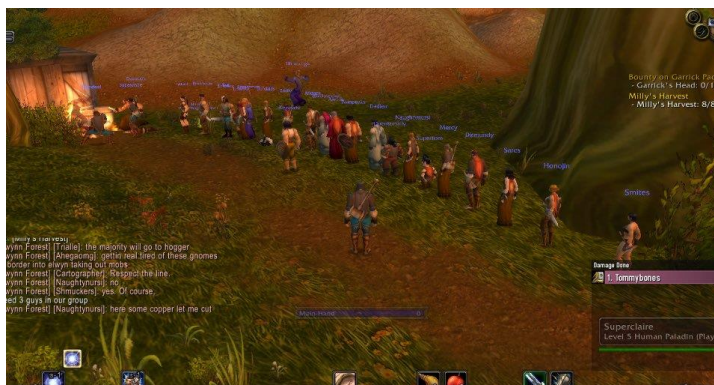
Fig. 7 – Players standing in line in World of Warcraft Classic 9

Boredom in video games can be an unintended result of a game's design. During the recent launch of World of Warcraft Classic , servers were so crowded that players had to wait for other players to finish a particular task so that they could have their go at it. One quest, for example, requires killing a specific non-player character (NPC) to complete it. Players had to form lines and patiently wait until it was their turn to slay the NPC (Hernandez 2019).