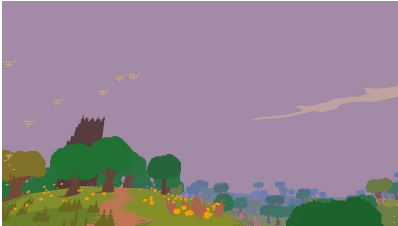
Fig. 8 – Proteus 10

if players lose all their lives. These threats give rise to the fear structure that orchestrates the events of a game. Players cannot choose to ignore it if they wish to keep playing. In contrast, the world of Proteus does not offer this kind of threat. Nothing can make players lose progress or lives, and the game does not stop unless the player decides to exit it. This lack of threats, however, risks tipping the scales in favour of boredom.