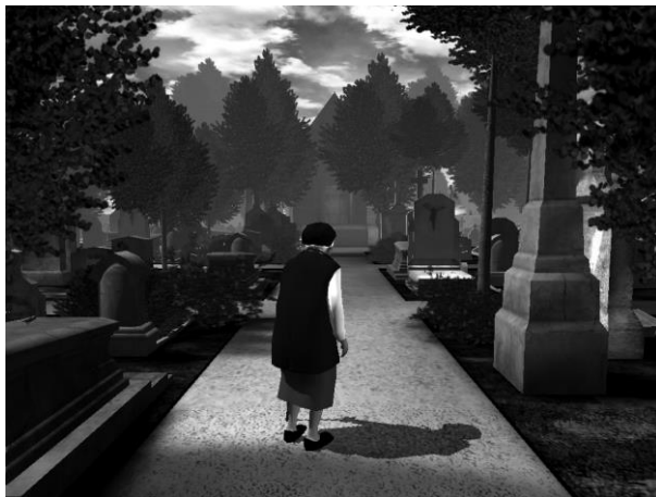
Fig. 9 – The Graveyard 12

Csikszentmihalyi gives the example of Rico Medellin, a man who reported entering a flow state at his work at an assembly line (Csikszentmihalyi 2009, pp. 39-40). Medellin's job was repetitive and trivially easy but, by paying attention and trying his best to improve his skills, he found a way to thoroughly enjoy it. Individuals in movement-induced trance states and experienced meditators can also achieve a state of flow. Flow can still be experienced in games like Proteus or ETS2MP , just like it can be experienced in an assembly line.