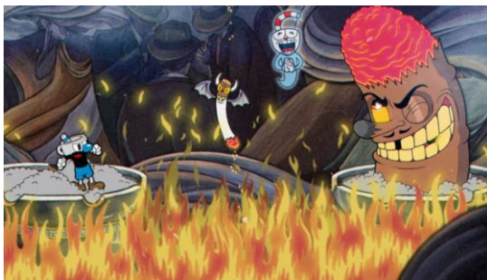
Fig. 3 – Cuphead 5

interactive (e.g. watching a movie). For this reason, they are more likely to keep our attention fully focused. But games need to be designed in a way that players are challenged to the extent of their skill. This is a tricky thing, since the skillset of the potential players of a game can vary according to their previous experience. For this reason, games often provide difficulty settings. But not every video game is for every player. The run-and-gun game Cuphead , famous for providing a steep challenge, can prove too frustrating for many, while it can be a fun challenge for others. A game like Euro Truck Simulator 2 , on the other hand, in which players drive trucks on digital renditions of European roads (cf. Leino 2018), can prove monotonous for someone seeking a challenge like the one provided by Cuphead , but can also be a source of pleasure for others.