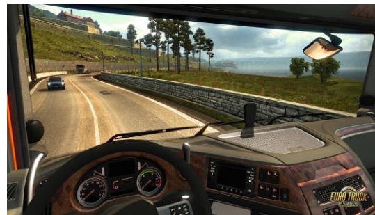
Fig. 4 – Euro Truck Simulator 2 6

The flow state is achieved when the challenge provided by the activity is not too high to make the player frustrated or anxious and not too low to make the player bored (figure 5). In figure 5, a player P starts playing a game with a low skill level but the game also provides a low level of challenge, allowing for the player to enter a state of flow (P1). As the game progresses, the player's skill level will increase. If the video game does not meet this increase in skill with a higher level of challenge, the player can get bored (P2). If, on the contrary, the game provides a level of challenge that exceeds the skill level of the player, this will make them anxious (P3). By progressively intensifying the challenge proportionally to the increasing skill of the player, the player can remain in the flow channel (P4).