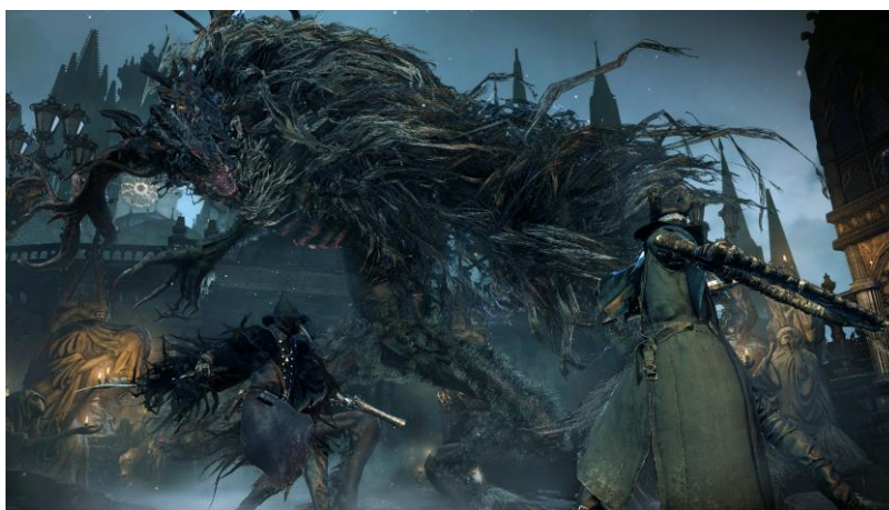
Fig. 6 – Bloodborne 7

While playing an action game like Bloodborne , the sudden appearance of a mighty foe might produce a spike of anxiety and fear that slows down time in the player's consciousness. The fight might at first prove too difficult, but after a series of trials players could start losing their fear and gaining more focus on the activity itself. Arousal can also be related to positive emotions, and these can slow down time as well. A study by Kim & Zauberman (2012), for example, showed that sexual arousal leads to the overestimation of duration. The elation produced by defeating the challenging enemy in Bloodborne could then lead to a dilated experience of time just like its abrupt entrance did.