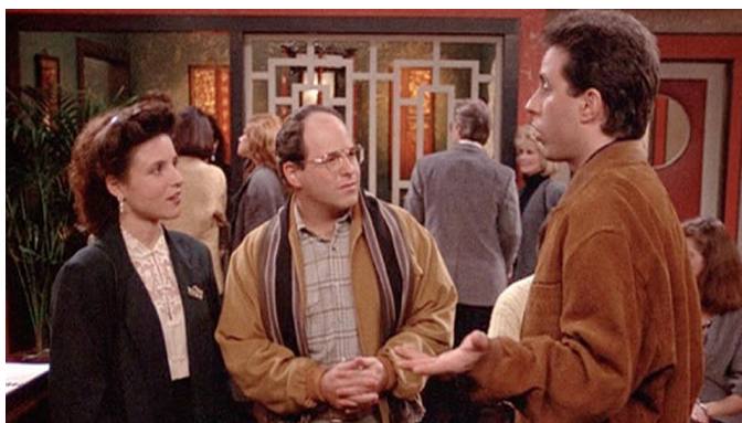
Fig. 1 – Seinfeld, The Chinese Restaurant 1

That such a mundane occurrence fills the whole duration of an episode of a television show—a medium characterized by plots with highly condensed action—underscores the central characteristic of waiting situations: time stretches and slows down in the consciousness of those who wait. On the other side of the screen, however, spectators are presumably experiencing the opposite phenomenon. Since the aim of the show is to amuse viewers with Jerry, Elaine, and George’s ordeal, the passage of time is likely to speed up in each audience member’s experience.