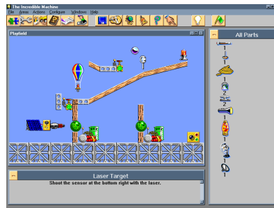
Figure 2: The Incredible Machine

Another variation of setup-only zero-player games are the commercial games where players can influence the game or level setup, but not influence gameplay after it has begun. The Incredible Machine (Figure 2) series of puzzle games is an example of this. The board game Space Alert can be seen as a weak example of a zero-player game since it has two main phases of gameplay where the latter allows no input from players. In the video game Peggle , the player shoots a ball and must wait for it to run its course through the playing field. These examples demonstrate that many, if not most, games contain zero-player passages.