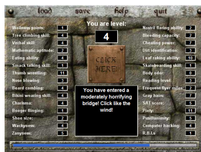
Figure 3: StatBuilder

Figure 3 shows the parodic game StatBuilder , which nominally follows a standard role-playing game progression of gradually improving character skills, but in practice only asks players to press a central button repeatedly, with no choices available. This does require action from the player, but the player is afforded no choices. Compare this to 4 Minutes and 33 Seconds of Uniqueness , in which the object of the game is simply to be the only person on the planet playing it for 4 minutes and 33 seconds. Both games deny the player the type of agency that we take for granted in games. Of course, these two games are also designed to be commentaries: the first is a commentary on the repetitive gameplay of massively multiplayer games and role-playing games, while the second questions what it is to play games in the first place. Both are zero-player games intended to be appreciated more as artifacts with potential activities than as actual activities enabled through these artifacts. We are not expected to put considerable time into playing these games, but rather to consider them as hypothetical experiences. Compare this to Richard Garfield's idea of "toy games" 1 , games that are never implemented but simply described to consider a point. Playing actual games is sometimes not as important as imagining or considering the potential gameplay of games.